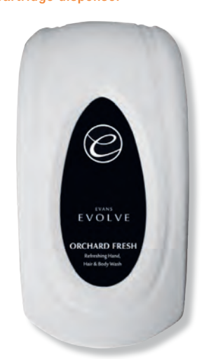
Product ID labels for your dispenser window are available free of charge.