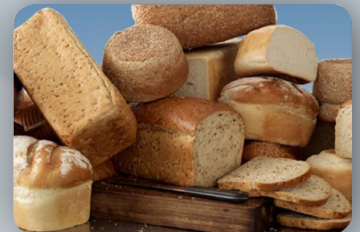
Bakery / Dry Food Processing